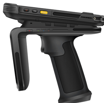
UHF Sled Reader